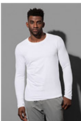
ST9620 Clive Long Sleeve