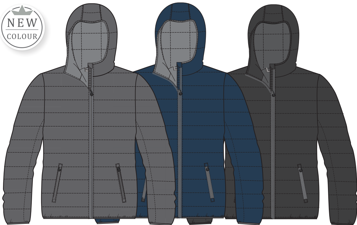
Space Grey / Grey